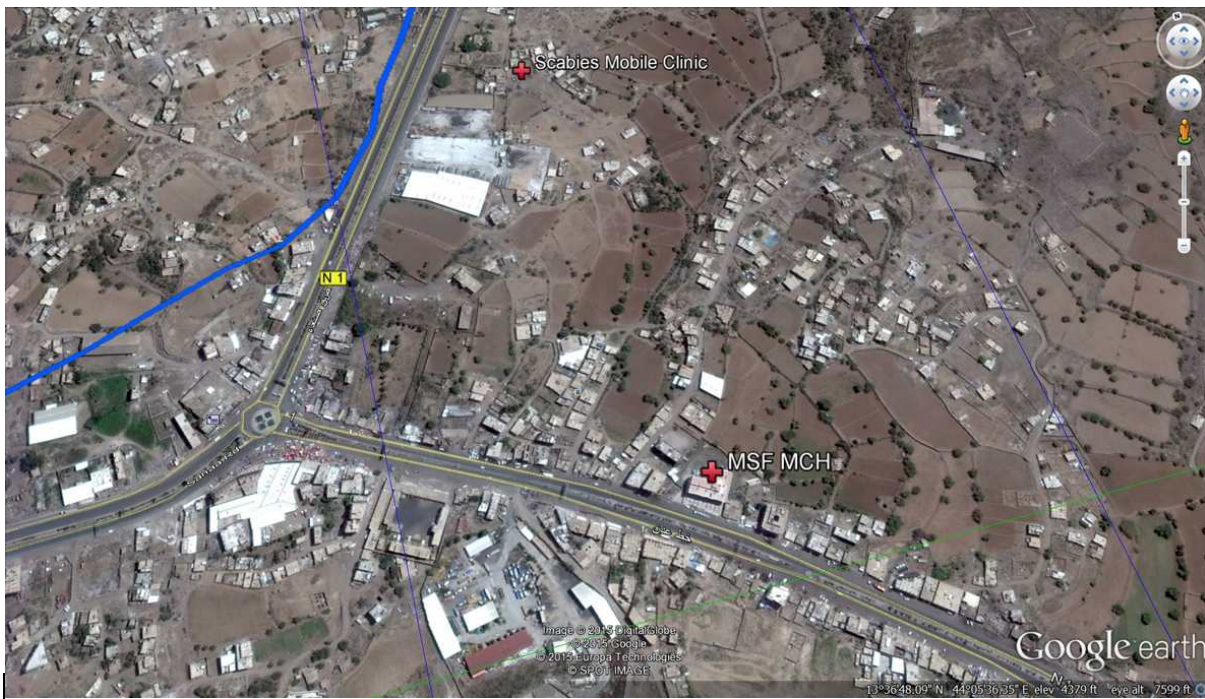
Email attachment 3: