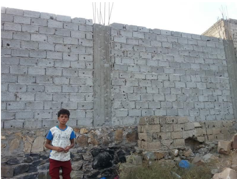
Three photos: Area surrounding the clinic and the damage caused by the airstrike, according to the local residents.