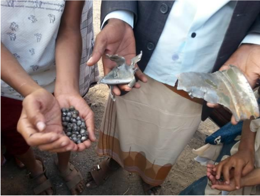
Shrapnel of the airstrike, according to local residents.