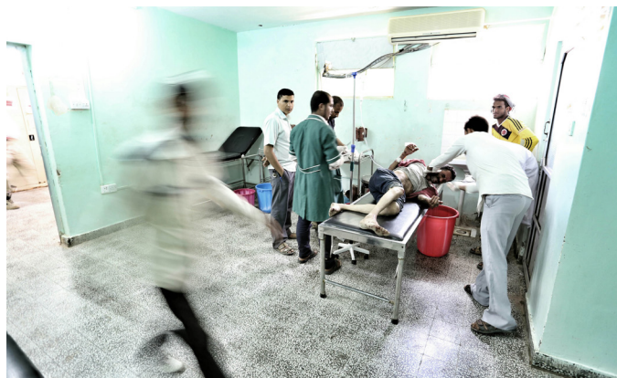
Yemen © Mohammed Sarabani